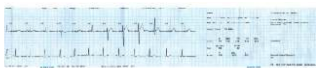
3 Ch ECG Report with Average Complexes, Quantitative Analysis and complete Interpretation